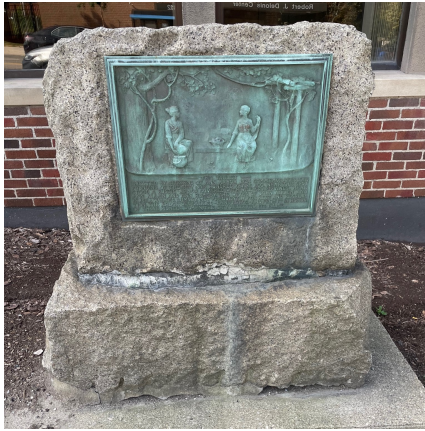
Plaque at 312 W. Huron